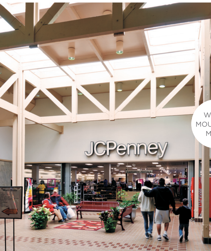
WHITE MOUNTAIN MALL